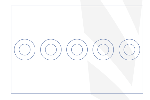
Holes and Countersink

Countersinking is used to enhance the suction effect of solely using perforation. This modification, which creates a conical shape on the top side of the belt, expands an existing hole, allowing air to make better contact with the product. Both slotting and routing increase the area of suction, thereby creating better vacuum.