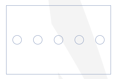
Single Row of Holes

Using precise tooling for exact diameter and hole spacing, manufacturers can punch and perforate holes in a belt to allow air to pass through it. This creates suction, which better holds objects in place as they move along the conveying path. Although this method is most often employed to achieve a vacuum or suction effect, it can also be used to vent water.